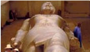
Ramses II in Memphis

In the afternoon we'll get to visit the Bazaars to shop for exotic goods. We'll return afterwards for dinner and overnight. Overnight, Cairo .