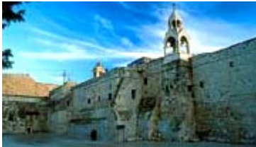
Church of the Nativity

We'll return to our hotel. Overnight, Jerusalem .